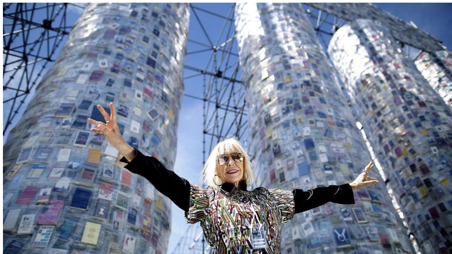
Marta Minujín in front of The Parthenon of Books in 2017

A 42m-long replica Big Ben lying on its side and made out of books will be unveiled this summer in the centre of Manchester, in northern England. The sculpture by the Argentinian artist Marta Minujín is called Big Ben Lying Down with Political Books and will be made from around 20,000 publications that “that have shaped British politics”, according to the press release. It will be part of this year’s Manchester International Festival (1-18 July), which includes events across the arts. Minujín’s work will be around half the size of the real Big Ben clock tower, which forms part of the Palace of Westminster, the home of the UK parliament. “The English people will be very surprised,” Minujín says. “Some will find lots of humour [in the work].” It is not the first time the artist has made sculptures using books: when the Argentinian military dictatorship came to an end in 1983 she created The Parthenon of Books , a replica of the ancient Greek temple made from once-banned books. The work was recreated in 2017 on the site of Nazi book burnings for Documenta 14 in